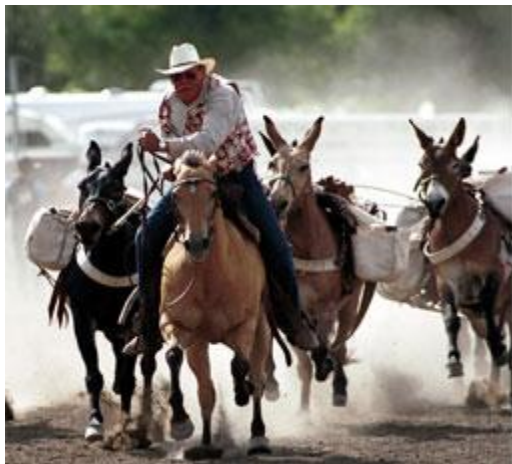
(Don't know who is in picture. Just thought it was a cool picture.)

Many current and former S&H members can be seen in the list of winners for the 2010 Mule Days show. The more than 200 classes included everything from Dressage, Reining, Cutting, Racing and Jumping, Driving classes for Teams, 4up and 6up Hitches, Packing, Shoeing, Panty Races and Chariot Steer Stopping (if you can do it with a Mule or Donkey, they did it) and most of these were very large classes some with more than 50 entries. It all sounds like a blast.